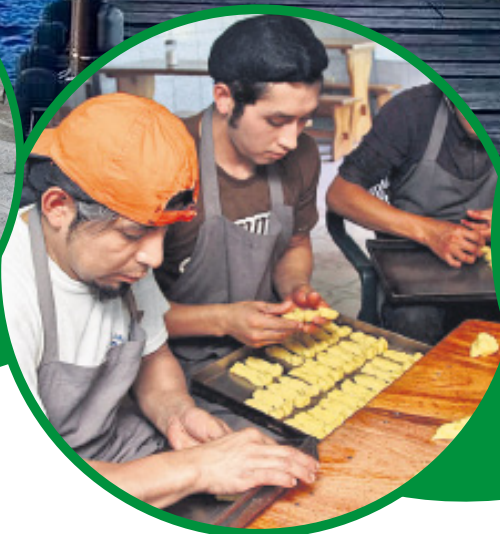
Learn how to prepare Ecuadorian dessert