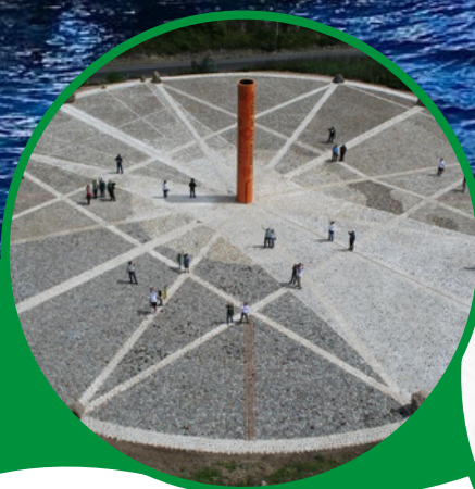
Visit the Quitsato Sundial