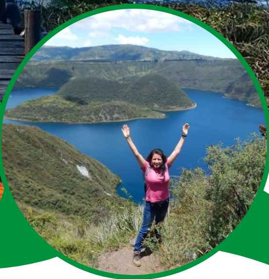
Visit to Quicocha Lagoon.