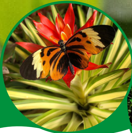
Visit the butterfly and orchid farm