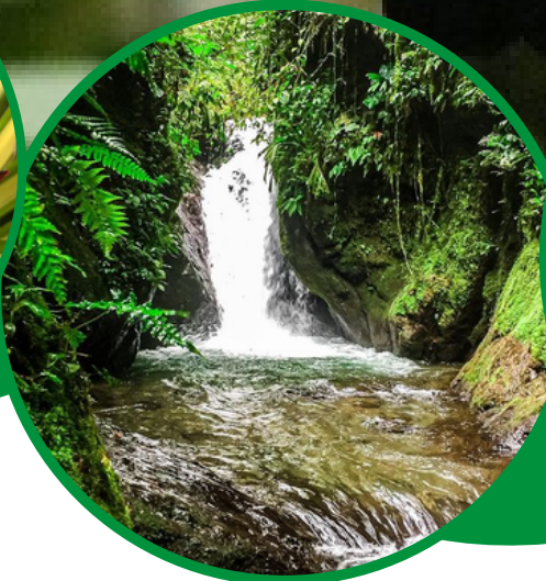
Hike to the river and waterfalls