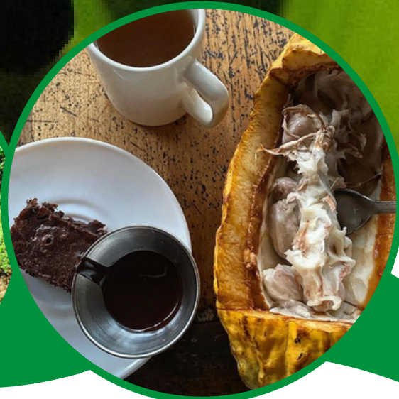
Visit the Chocolate Factory